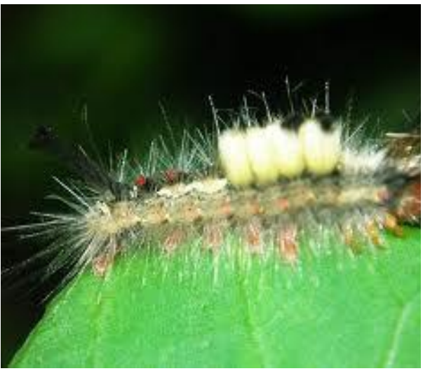
The helpful worm