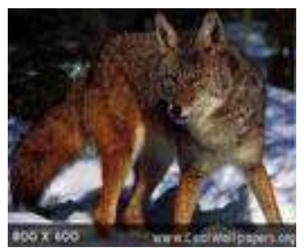
II.3.8. Fox (noun) -> fox (verb)

Foxes are members of the wild dog family. Worldwide they comprise a group of over twenty species, characterized by grace and adaptability. Because they are closely related to domestic dogs, they seem tantalizingly familiar, yet their wildness brings an elusive mystery. Foxes are small medium-sided (slightly smaller than the median – sized domestic dog) characterized by processing a long narrow snout, and a bushy tail (or brush). Unlike many canids, foxes are not usually pack animals. Typically, they live in small family groups and are opportunistic feeders that hunt live prey (especially rodents). Using a pronouncing technique practice from an early age, they are usually able to kill their prey quickly.