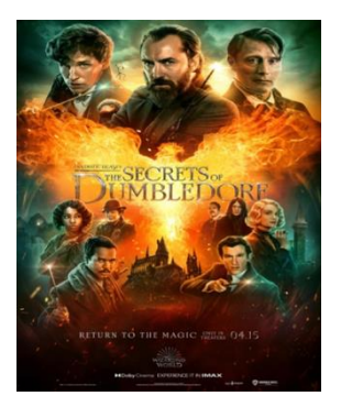
Example 3: Fantastic Beast: The Secrets of Dumbledore (Sinh vật huyền bí: Những bí mật của Dumbledore) A rather long and impressive title, there is nothing to talk about its genre from its name itself. An adventure and a fantasy

A movie title that clearly expresses the genre of the film. Audiences don't even need to see more information or trailers of the movie to know that this is a horror movie genre.